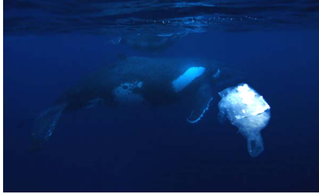
A Humpback Whale and Calf, with plastic threatening their survival, image captured in the Ha'apai Islands, 2009

The unique environment of the area - a breeding ground for humpback whales which was once nominated as a UN World Heritage Site - has been threatened through the concentration of plastic entering the ocean.